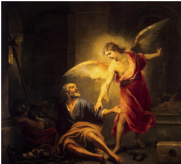
Bartolomé Esteban Murillo, Liberation of St. Peter

Need more info? Check out www.MarchForLifeChicago.org .