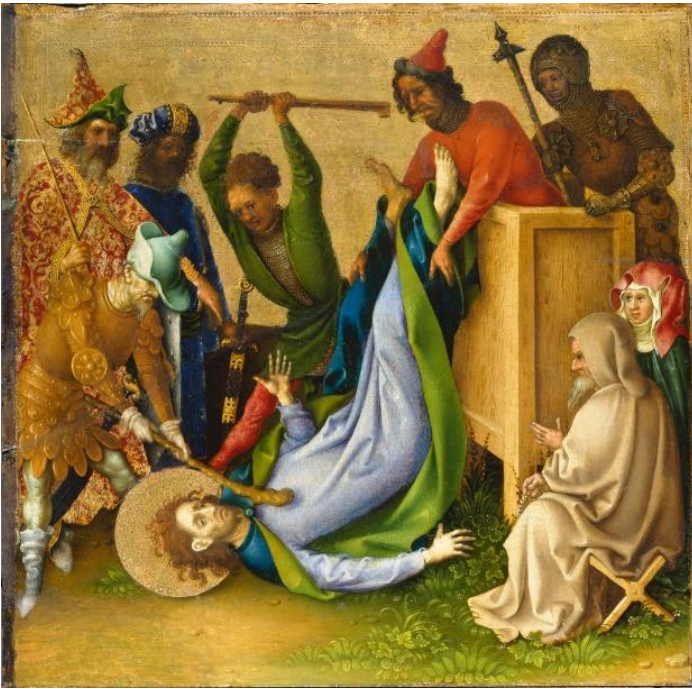
“Martyrdom of St. James the Younger,” by Stefan Lochner (d. 1451)

James is also said to have preached the Gospel in Judea, Edessa, Gaza, Eleutheropolis, and Egypt, where he was crucified by pagans.