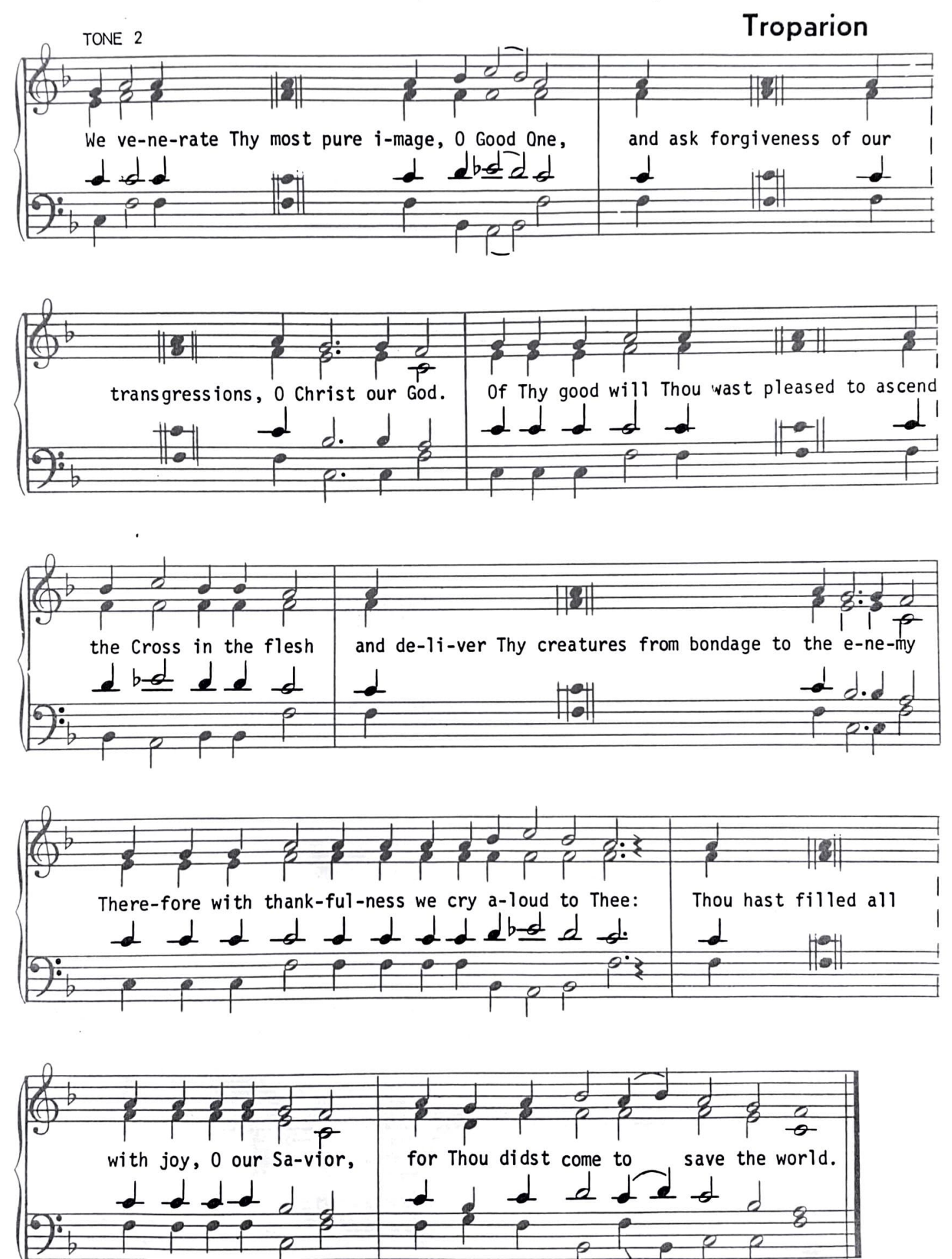
The First Sunday of Great Lent: Orthodoxy